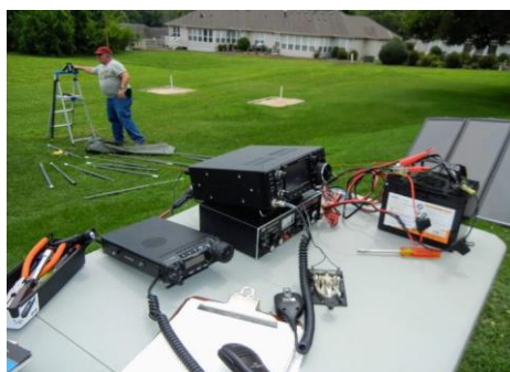
Joe-W5AEN prepares the solar power station