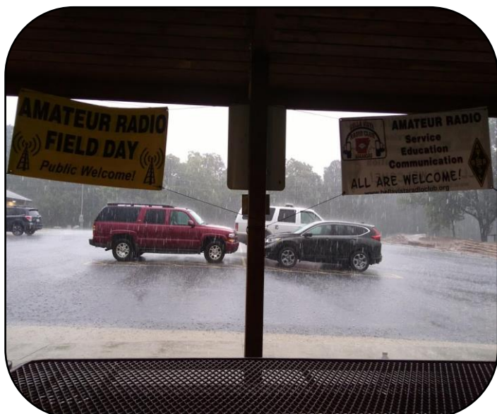
Sunday morning sunrise, and with it the floods came