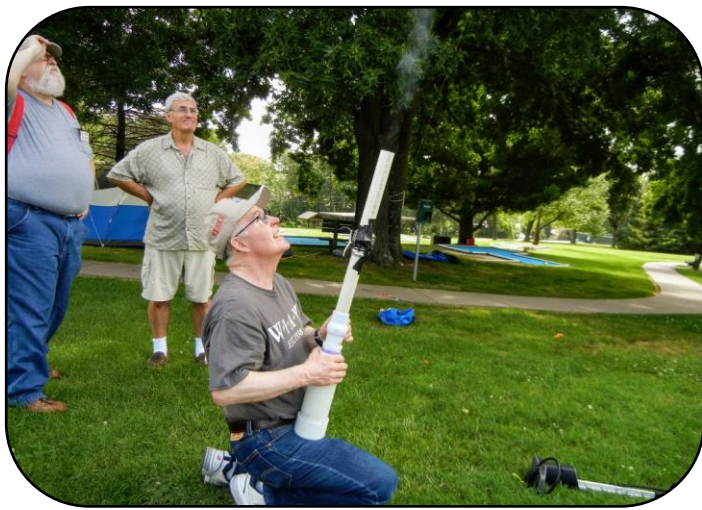
Don-K5DB demonstrates the ultimate method in hanging dipole antennas between trees for maximum height – a pneumatic antenna launcher