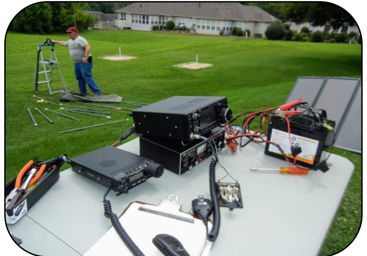
Joe-W5AEN prepares the solar power station for demonstration – great setup, Joe!!!