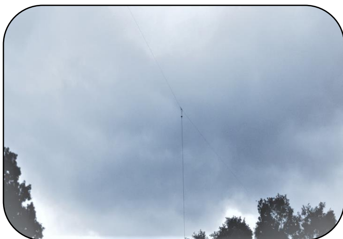
One of the Carolina Windom-80 dipoles used for BVRC Field Day, this one up about 60’

The first 12 hours on Saturday were ‘near perfect,’ as we demonstrated our annual “Open House for the Public.” At its core, Field Day shows how hams are independent of commercial power, cell phones and the internet, and capable of quickly deploying portable stations using emergency power to provide back-up communications, wherever and whenever it is needed.